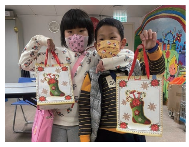
Children in Tin Shui Wai received presents prepared for them with love from the volunteers