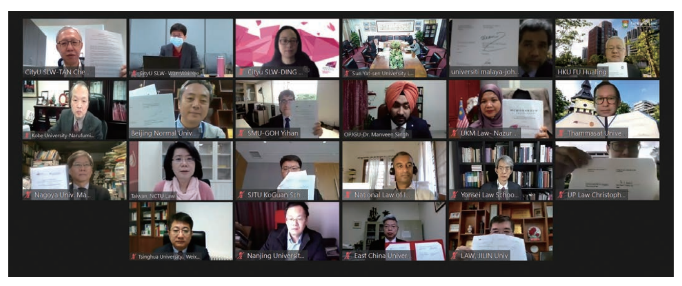
Virtual Signing of the ALSA Memorandum of Understanding