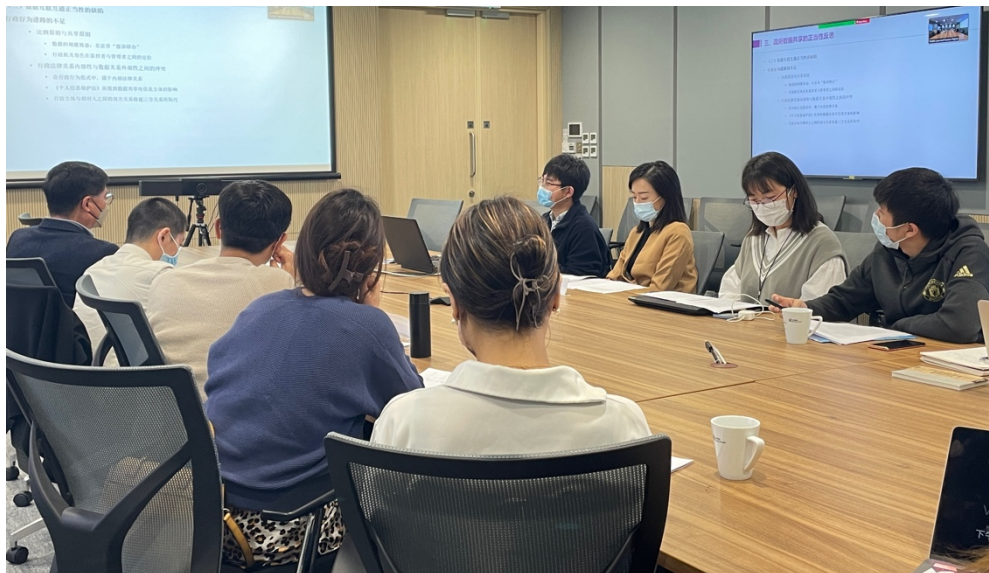
Picture 1 Panoramic view of the venue