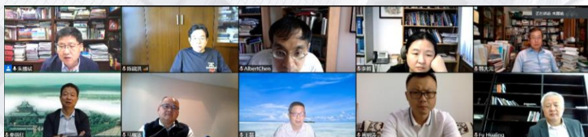
Screenshot of some of the participants of the National Security Law Symposium

This online symposium was jointly organized by CCCL and the Public Law and Human Rights Forum (CPLR) of City University of Hong Kong School of Law. A total of 14 experts and lawyers from mainland China, Hong Kong, Macau and overseas were invited to share their views on the Decision of the National People's Congress on Establishing and Improving the Legal System and Enforcement Mechanisms for the Hong Kong Special Administrative Region to Safeguard National Security — which was passed on 28 May 2020 and served as the legal basis of the Central People's Government's subsequent promulgation of the Law of the People's Republic of China on Safeguarding National Security in the Hong Kong Special Administrative Region and making it part of the law of the HKSAR.