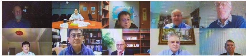
Legal experts who presented at the CISG Symposium

was issued on 2 March 2020. The purpose of this symposium was to solicit comments from some of the leading experts on the CISG from the UK, Australia, Hong Kong and Singapore on the applicability and application of CISG in Hong Kong from both theoretical and practical perspectives.