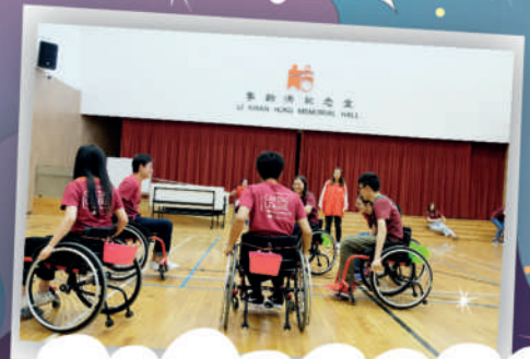
Inclusion Ambassador Training Day Camp