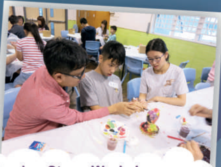
Loving Stone Workshop