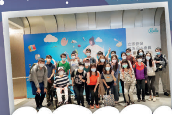
The Peak Half-Day Tour with students with SEN