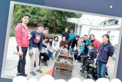
BBQ Day Camp with students with SEN