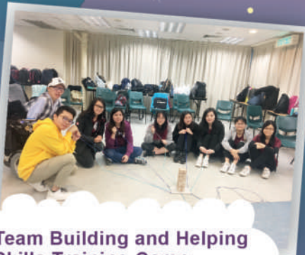
Team Building and Helping Skills Training Camp