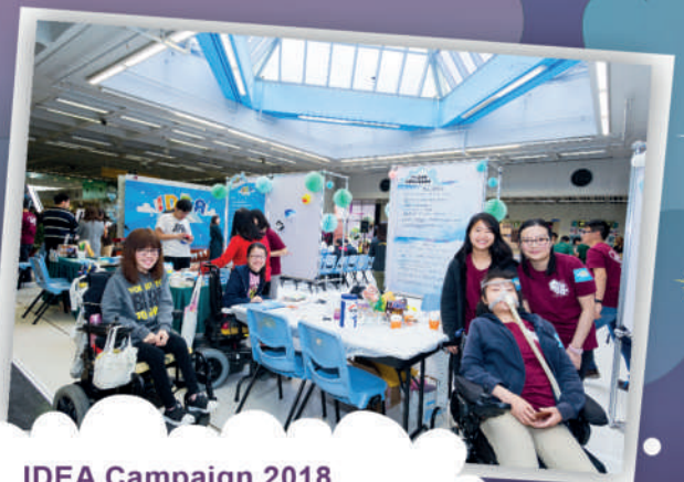
IDEA Campaign 2018