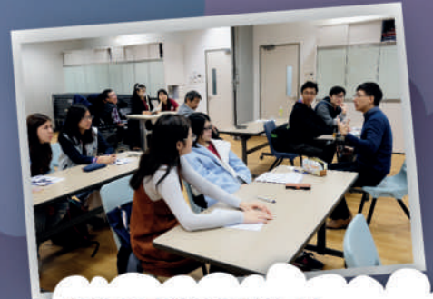
Talk conducted by an Educational Psychologist