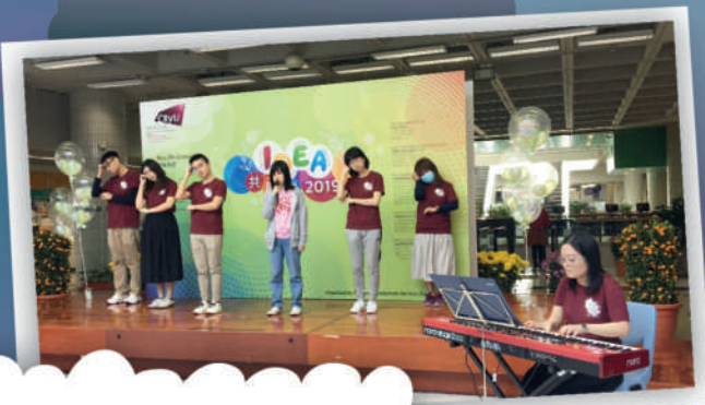
IDEA Campaign 2019