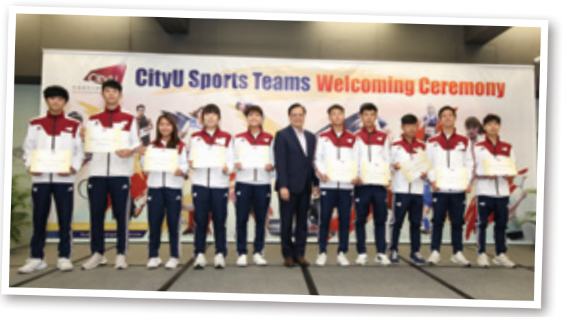
▲ Awardees of Outstanding Athletes Entrance Scholarships for Local Students (Regional Level) 傑出運動員入學獎學金(亞太區水平)得獎學生