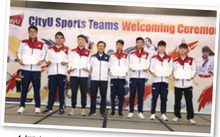
▲ Awardees of Sports Scholarship for Elite Athletes 精英運動員獎學金得獎學生