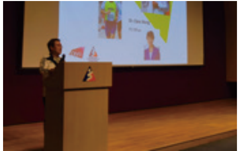
▲ Sharing session in Hong Kong Sports Institute 香港體育學院座談會