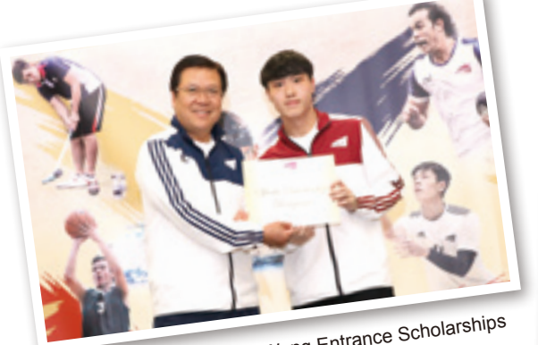
Awardee of Stewart Wong Entrance Scholarships for Outstanding Table Tennis Players