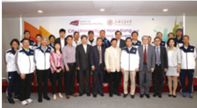
▲ Representatives from CityU and SJTU in the Opening Ceremony Welcoming Lunch 城大與交大代表於開幕午宴之大合照