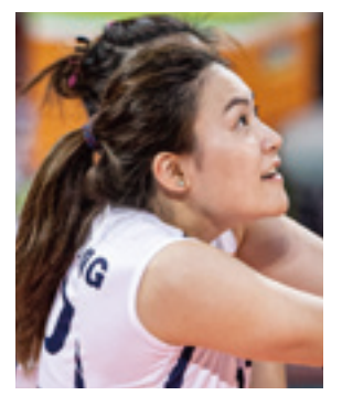
Pang Wing Lam Women's Volleyball