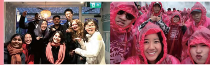
University College London, UK