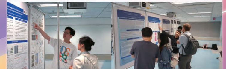
Research Showcase by Students

Celebration of students' and faculties' achievements