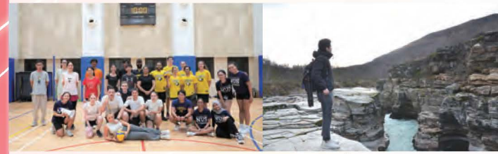
National University of Singapore, Singapore