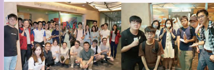
Student Connect – Departmental Tea Gathering

Each new student will be paired with one Academic Advisor and one Peer Consultant