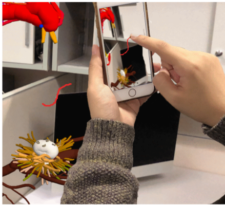
(a) 3D sketching in mobile AR

Computer/AI/Data Processing and Information Technology