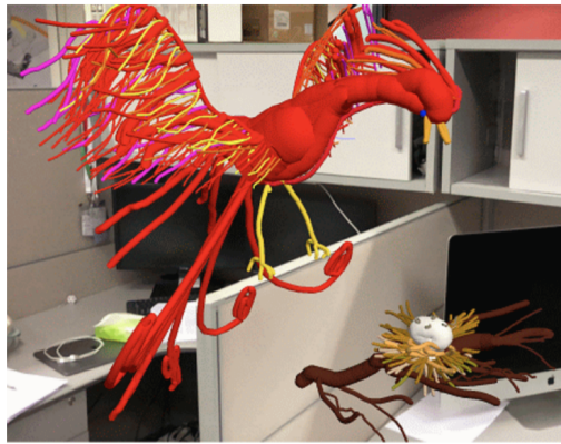
(b) "Phoenix" (34.2 mins)