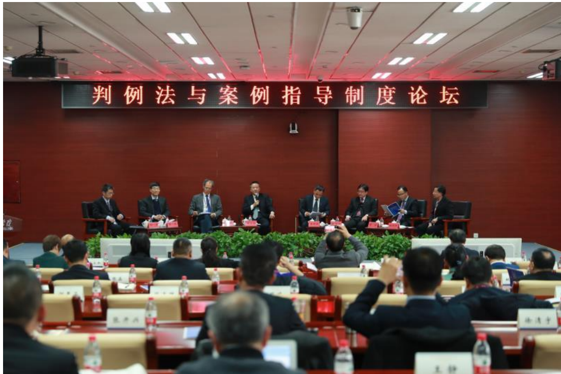
Case Law and Case Guidance System Forum