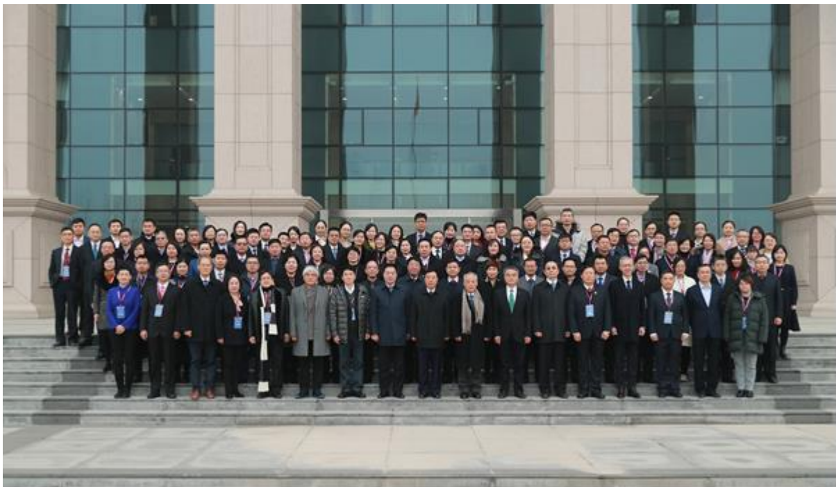
Group photo of officiating guests and participants