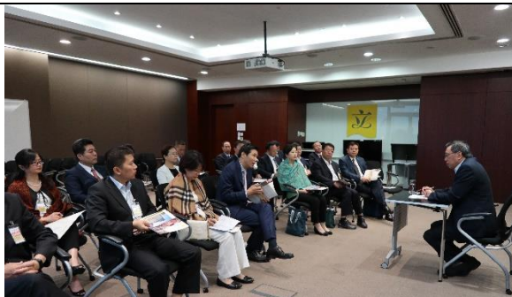
Meeting Mr LEUNG Kwan-yuen , President of the Legislative Council