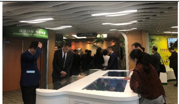
Visit to the Hong Kong Customs and Excise Department