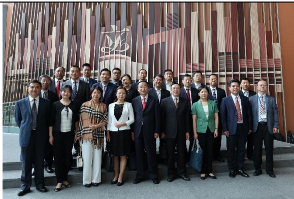
Group photo at the Legislative Council