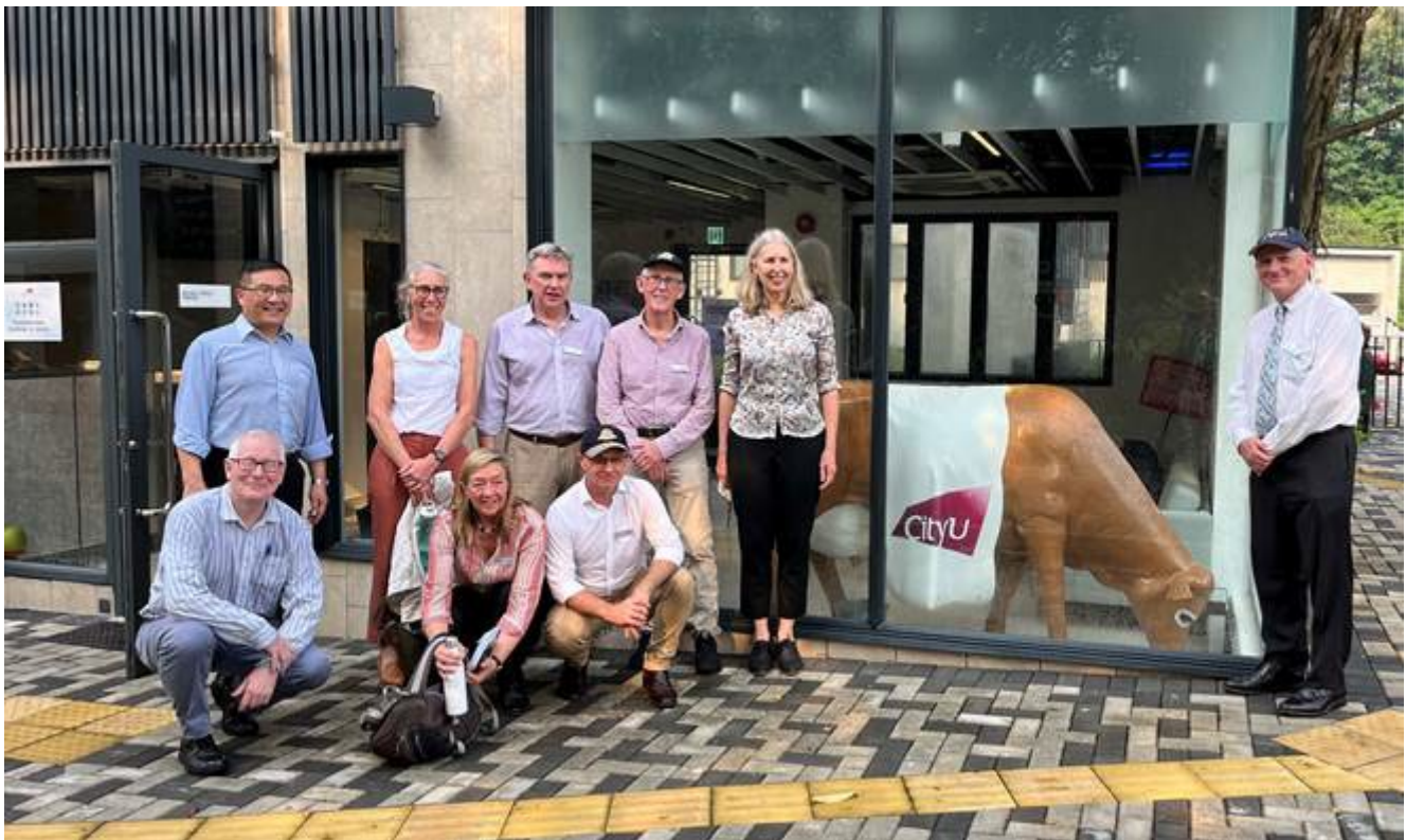
The AVBC accreditation team visited CityU farm and commended us on this new teaching facility.

Please read below for all of our fabulous news from the JCC over the last few weeks. While some in the College have been involved in accreditation, there have been many other events and successes like the BMS Research Gala.