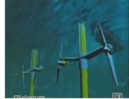
Tidal & wave