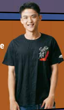
Cop / Ensemble

It's an honor for me to be part of the CityU Musical for the second year. Sister Act was such a classic comedy back in the 90s and we are now reenacting it! We are fabulous! God has brought you here to our show for a reason. Take the hint. Vamos!