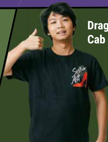
Drag Queen / Cab Driver

Participating in CityU Musical was a big challenge for me. Although I had some music background, acting and dancing were completely new to me. I encountered many difficulties, but I was really grateful for all the help I received from my pals. I could not have performed that well without them.