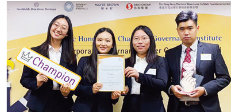
CityU undergraduates were awarded for their insightful opinions on corporate governance.