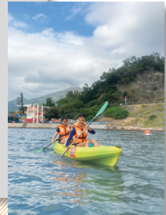
CityU was granted a Gold Campus Award for 2021 under the Exercise is Medicine® On Campus (EIM-OC) programme for Promoting health and well-being on campus.