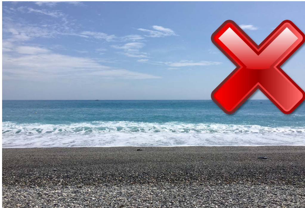
Photo NOT Acceptable