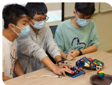
▲ CityUHK BME Competition