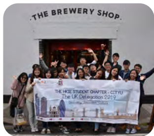
▲ HKIE UK Delegation