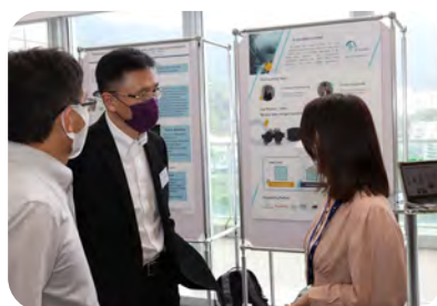
▲ CityUHK BME Fair