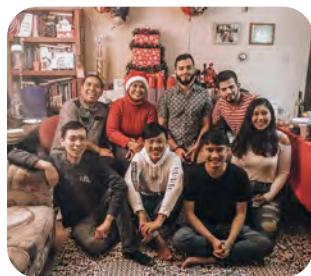
▲ Student Exchange