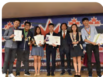
▲ Innovation Competition in Canada