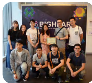
▲ Singapore Study Tour