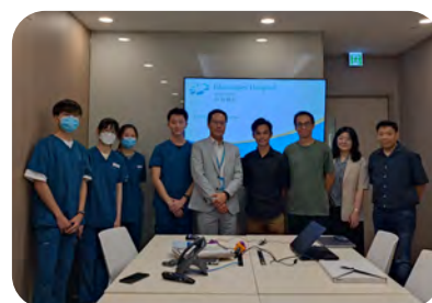
▲ Gleneagles Hospital