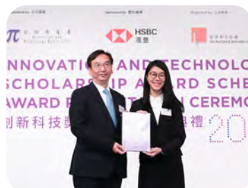
▲ Innovation and Technology Scholarship Award