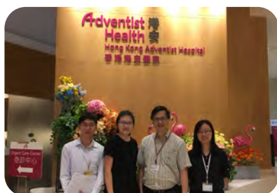
▲ Hong Kong Adventist Hospital