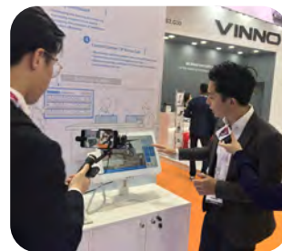
▲ Medical Expo in Dubai