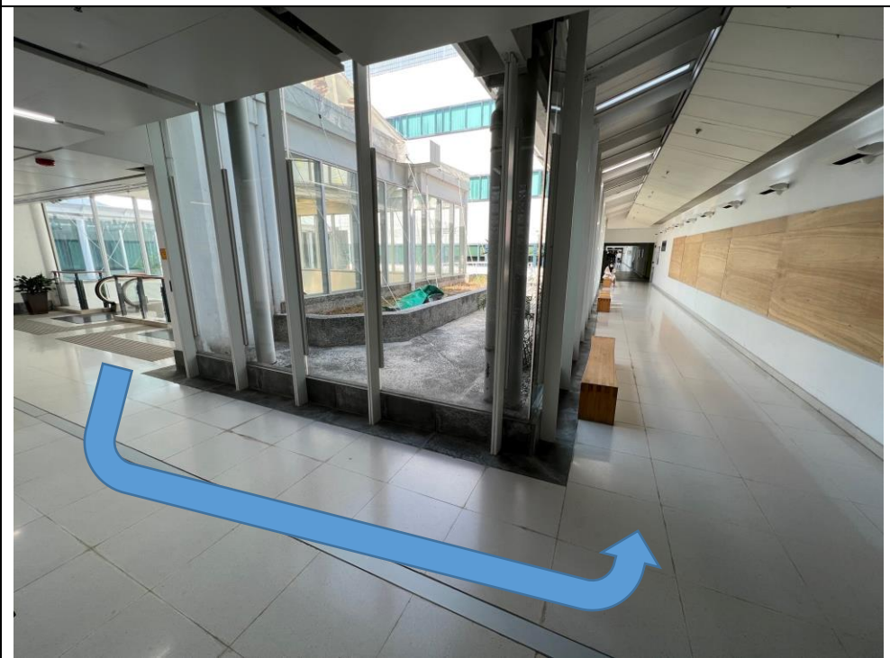
Turn left and left