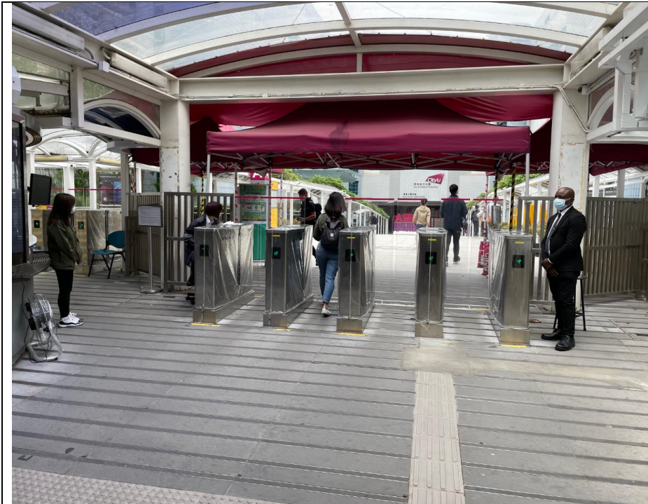
CityU entrance on leaving the subway

The best way to go to Yeung Kin Man Academic Building (YEUNG) is to enter the CityU entrance via the subway from Festival Walk and follow the map as below: