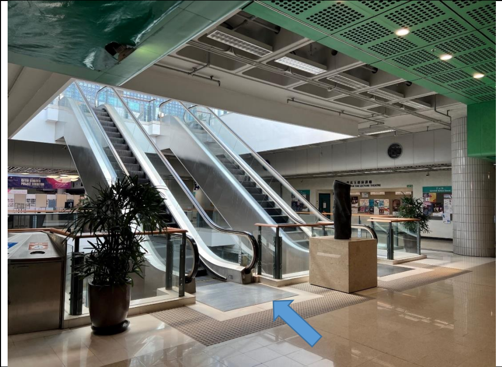
Go up via escalator