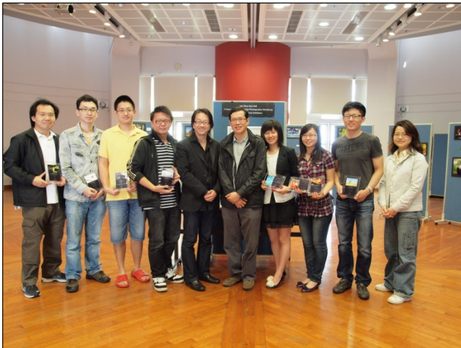
LSK Hall Creative Photography Workshop Learning Outcome Expo