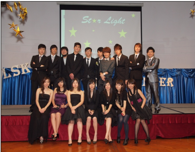
李兆基堂第五屆宿生會 — Sixtizen