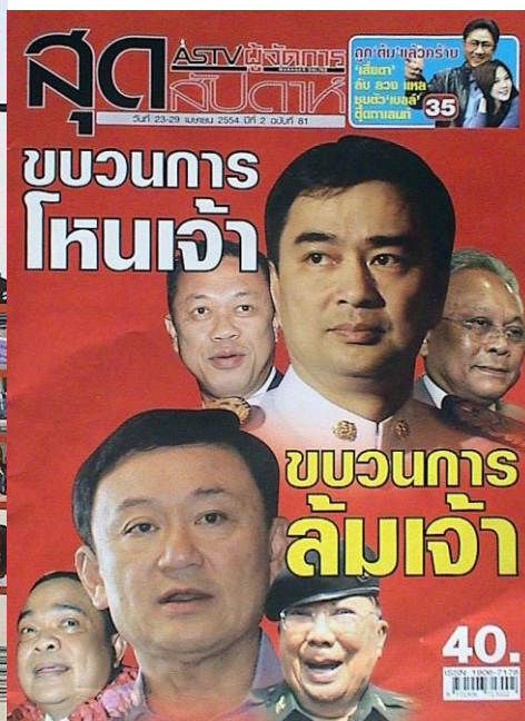
Pictures 1-3: Titles pages depicting the electoral alternatives. The picture on top is from the red-shirt paper Mahaprachon . It says, “The Thais must decide” between “talking” (Abhisit) and “doing” (Yingluck). The picture on the lower left side is from Lokwanni Wansuk , a paper sympathetic to the red-shirts. To this weekly, the alternative was between, [Abhisit] “handsome (the puppet of the ammart ),” and [Yingluck] “beautiful (the clone of Thaksin).” The third title page is from the PAD mouthpiece ASTV Phuchatkan Sutsapda . To this paper, the alternative was between “the movement that clings to the king” (symbolized by Abhisit), and “the movement that wants to topple the king” (symbolized by Thaksin).