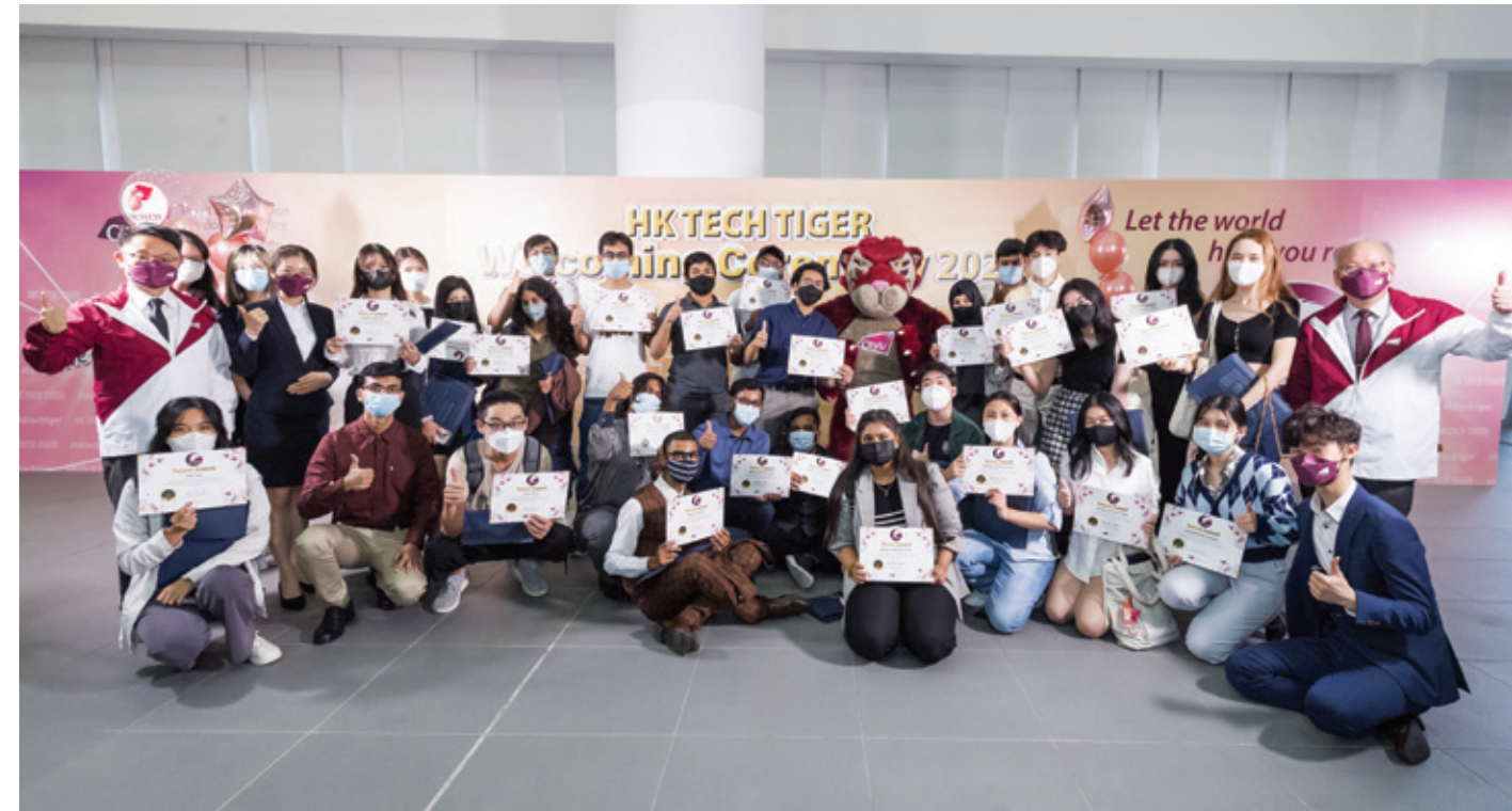
The University welcomed the new batch of CityU Tiger students. 城大歡迎新一屆「老虎班」學生。

2022年9月，城大舉行「老虎班」迎新典禮，歡迎新一屆近700名「老虎班」菁英學生加入，與他們攜手開展未來領袖之路。這是城大在2021年推出的一項嶄新措施，旨在讓追求卓越的優秀學生發展潛能，修讀世界頂尖STEM教授的課程。「老虎班」成員均是最優秀的學生，包括來自不同學院成績最頂尖的10%學生，以及在公開考試獲優異成績的一年級生。