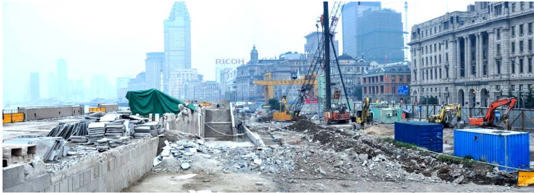
The Bund, giving way or getting prepared for the 2010 World Expo?