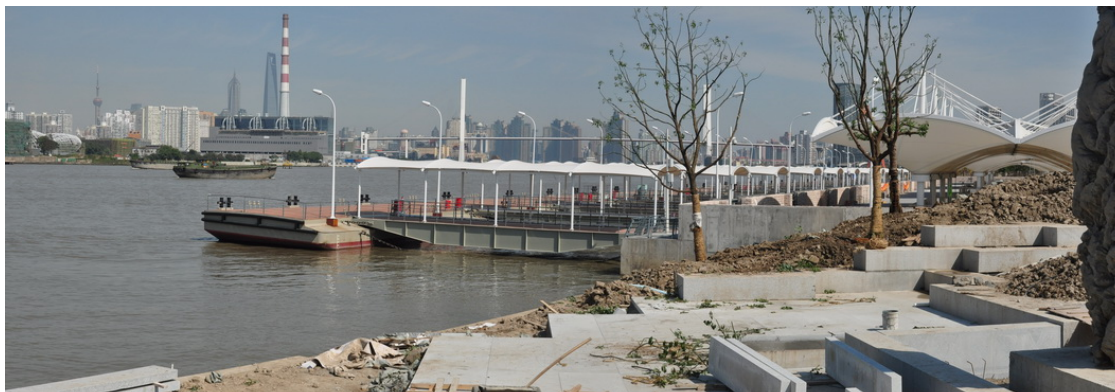
Other support facilities – the passenger pier and landscaping areas