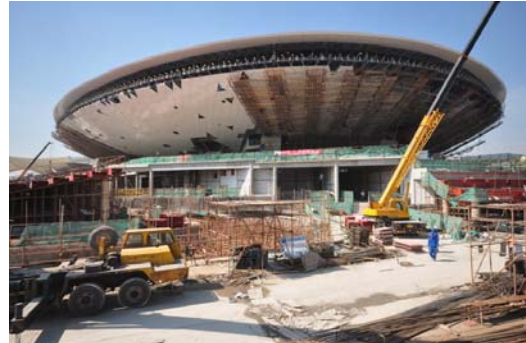
The dragon head of the Expo facilities, the China Pavilion and the Expo Performance Centre