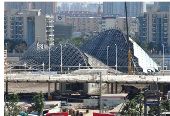
Other pavilions under construction