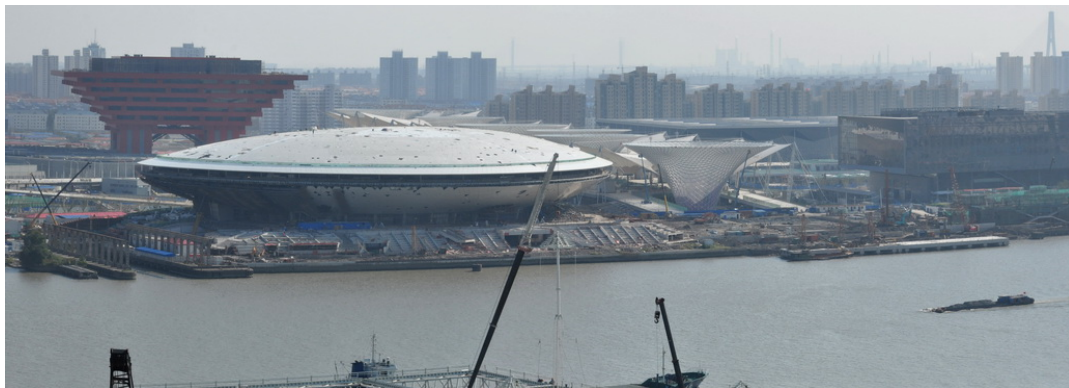
View of the main Expo pavilions from Puxi