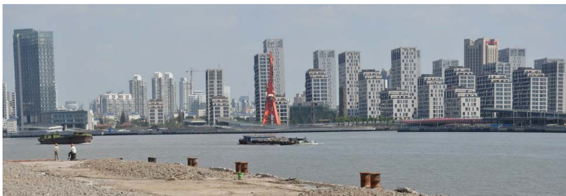
Other support facilities – the Expo village