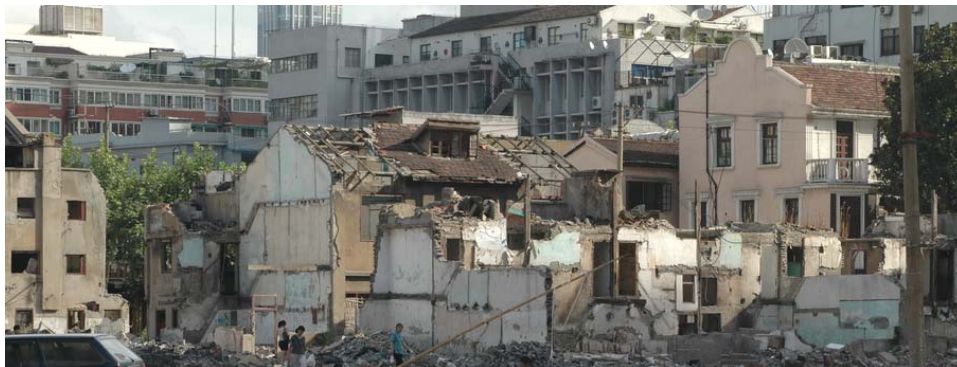
Shanghai under transition