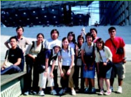
■ Study Tour to Paris