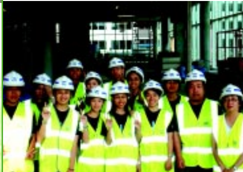
■ Site Visit to BBC Building under construction in London