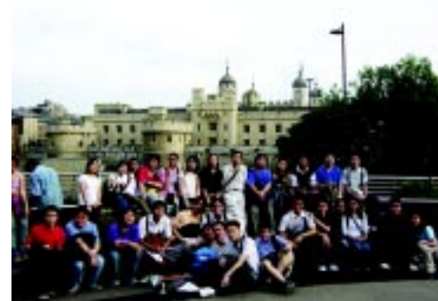
■ Study Tour to London

A study tour to Shanghai gave students the opportunity to observe and learn about the academic environment in Shanghai, as well as local construction practices and methods, safety requirements and land management systems.