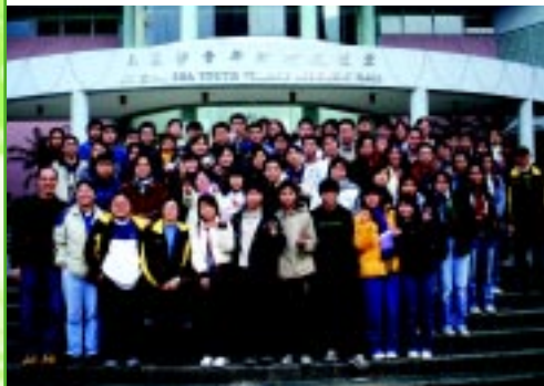
■ Student retreat at Wu Kwai Sha Youth Village