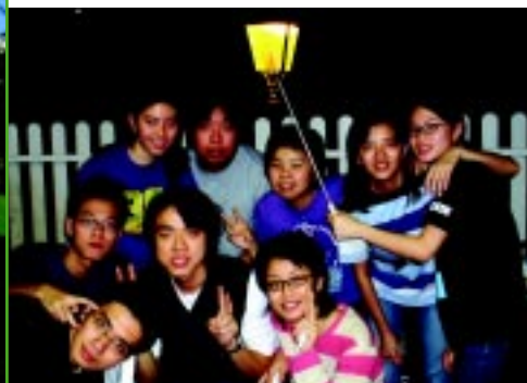
■ Surveying students having a barbecue with the staff within the University campus