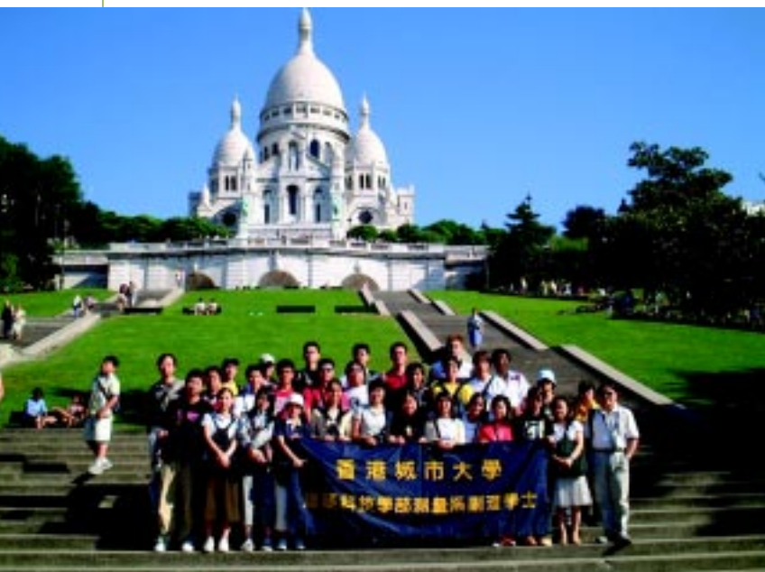
■ Study Tour to Paris