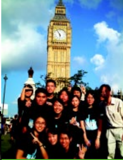
■ UK Study Tour in front of Big Ben, London